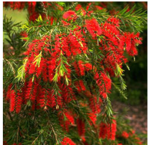
Captain Cook Bottlebrush