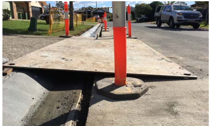
Typical access provided to driveways where kerb is being replaced.