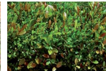
Syngium australe 'Tiny Trev'