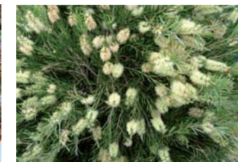
Callistemon citrinus 'White Anzac'