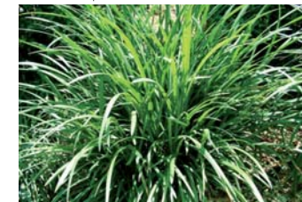
Liriope muscari 'Evergreen Giant'