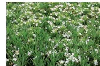
Myoporum parvifolium