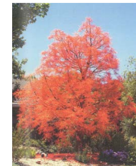
Brachychiton acerifolius