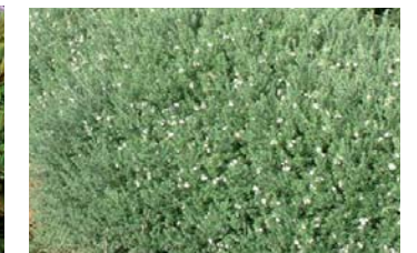
Westringia fruticosa