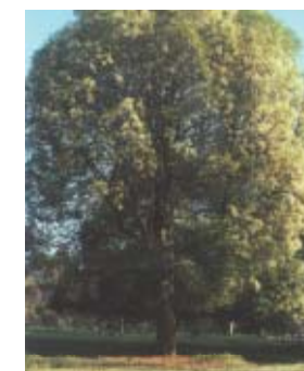
Flindersia australis