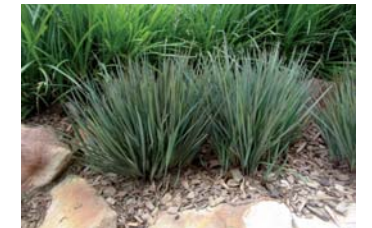
Dianella revoluta "Little Rev"