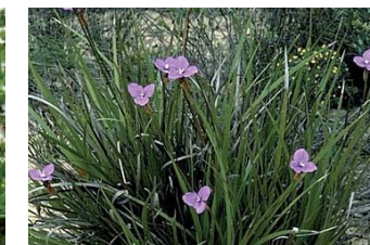
Patersonia sericea