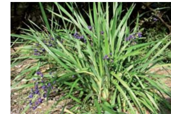
Dianella caerulea