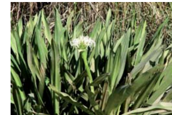
Crinum pedunculatum