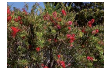
Callistemon viminalis 'Rose Opal'