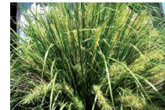
Lomandra hystrix