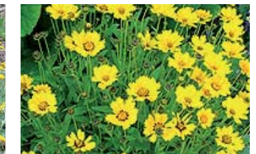
Gazania splendens