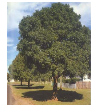
Harpullia pendula