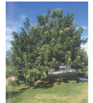
Cupaniopsis anacardioides