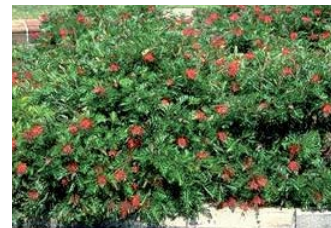
Grevillea 'Robyn Gordon'