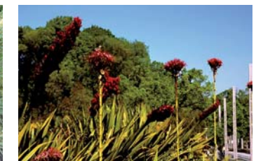
Doryanthes excelsa