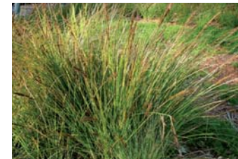
Carex appressa