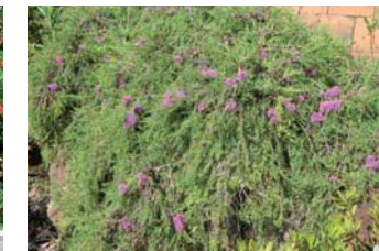
Melaleuca thymifolia