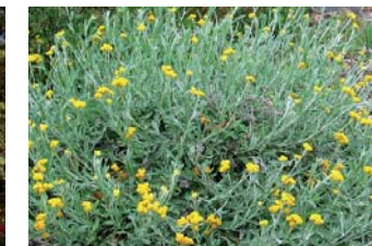
Chrysocephalum apiculatum