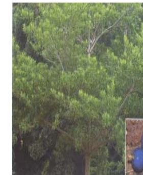
Elaeocarpus grandis