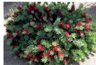
Callistemon 'Little John'