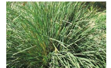
Lomandra longifolia