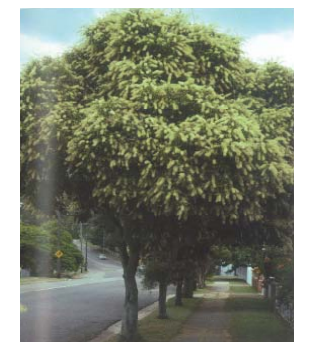
Buckinghamia celsissima