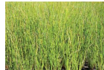
Isolepis nodosa