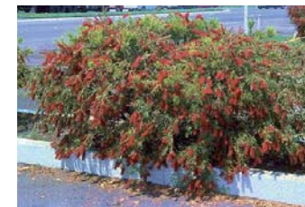
Callistemon 'Captain Cook'