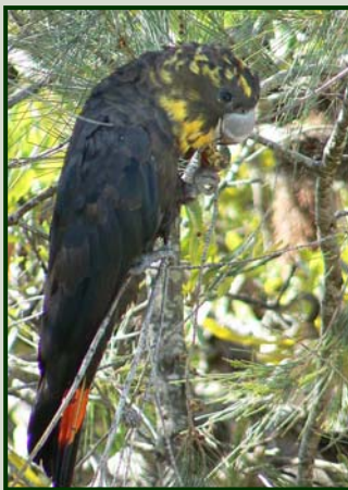
Plate 1: Female Glossy Black-Cockatoo

Unlike other cockatoos, Glossy Blacks ( Plate 1 ) are generally secretive and are not raucous - they call little and then in subdued notes. When seen, however, they are still commonly mistaken for other species, notably the Red-tailed Black-Cockatoo ( Calyptorhynchus banksii ) ( Plate 2 ) and Yellow-tailed Black-Cockatoo ( C. funereus ) ( Plate 3 ). In appearance, Glossy Blacks are most readily distinguished by their broad, bulbous bill; dull, brownish tinge on the head and breast (despite the name!); and low, rounded crest, whereas both Red-tails and Yellow-tails are bigger, 'blacker' birds, the former with a larger, helmet-like crest and the latter with distinctive, large yellow panels in a long tail. Glossy-blacks are also usually seen in pairs or small groups (as opposed to Yellow-tails and Red-Tails, which often occur in large flocks) and their call (distant, drawn-out "tarr-red") is softer and more feeble than Red-Tails (far-carrying, drawn out trumpet sound "kree", like a rusty windmill) and Yellow-tails (weird, far-carrying squeal - "wee-lar").