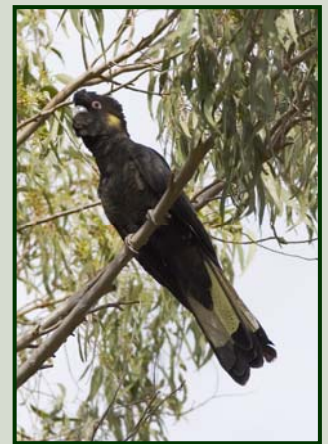
Plate 3: Yellow-tailed Black-Cockatoo