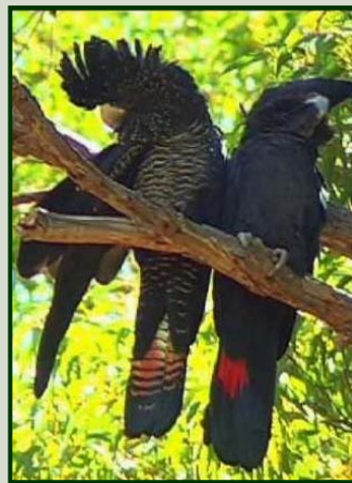
Plate 2: Red-tailed Black-Cockatoos