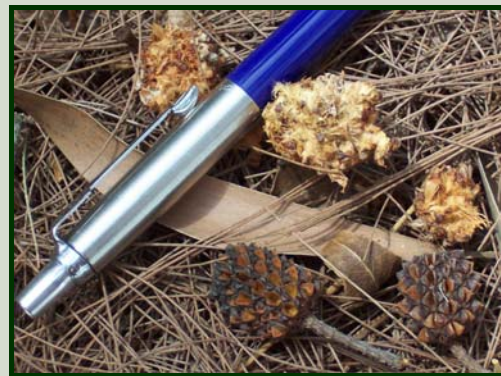
Plate 6: Chewed she-oak ( A. littoralis ) cones (Orts)

Monitoring of Glossy Black-Cockatoo populations in SEQ needs your help. This not only includes sightings of the bird, but also the locations of known resources. The best way to find out if a she-oak has been used as a feed tree is to find an 'Ort' (Plate 6) - the discarded chewed cone from a she-oak. These can be found under a feed tree for several weeks following foraging.