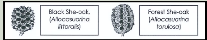
Plate 5: Comparison of A. littoralis and A. torulosa cones

Where practical and safe, also strive to protect, maintain or enhance known or potential water sources and nesting trees/hollows in your area. If you already have Glossies in the area, you could even try installing a bird bath to see if they become regular afternoon visitors.