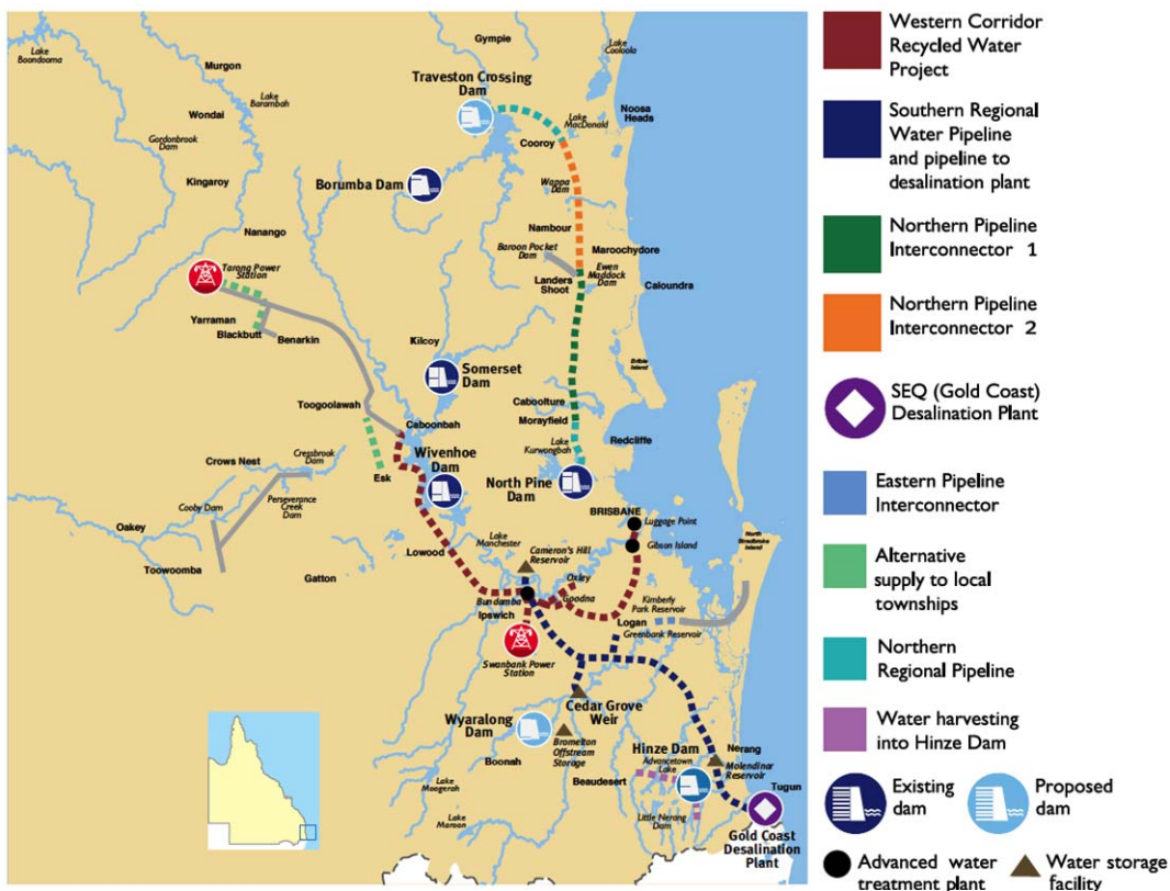
Figure 2 - Seqwater Water Supply

LCC is part of the South East Queensland (SEQ) Water Grid, managed and operated by Seqwater. The SEQ Water Grid is an extensive drinking water distribution system that includes the Sunshine Coast, the Gold Coast, Brisbane, Ipswich, Lockyer Valley, Logan, Redlands, Moreton Bay, Noosa, Somerset and Scenic Rim Regions as shown in Figure 2.