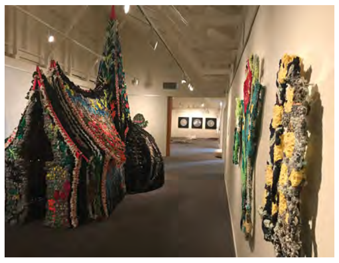
Green asylum exhibition by Charlotte Haywood at Logan Art Gallery, 2019