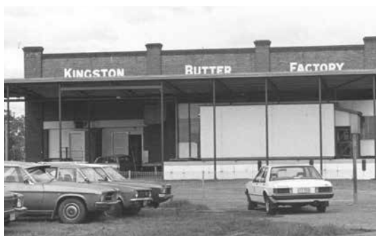
Kingston Butter Factory exterior circa 1980