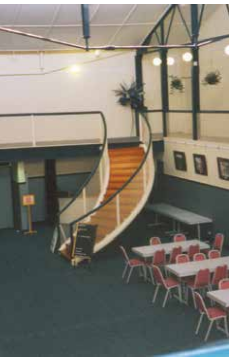
Kingston Butter Factory atrium