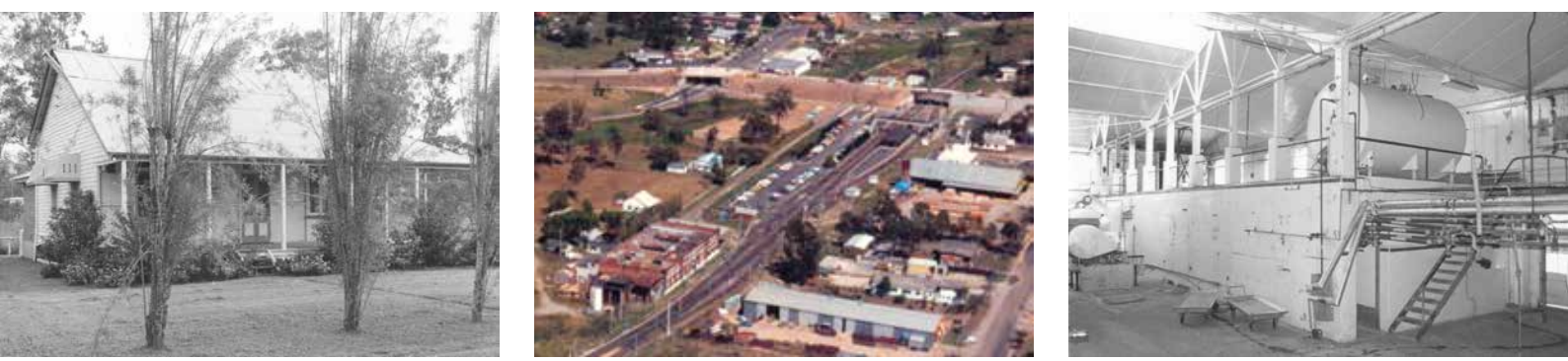
Factory cottage circa 1980

In 1966 QUF installed spray drier equipment to produce skim milk powder at Kingston. Those farmers who remained in the industry installed stainless steel milk vats on their farms which were collected by Pauls, with most going to the city. A small quantity was processed at Kingston. From 1974 the production of cottage and baker's cheese commenced. By 1979 the factory no longer took in milk and in April 1983 it ceased production all together.