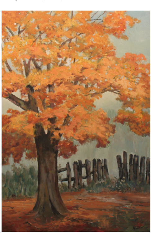
The rabbit, 2014, oil on canvas