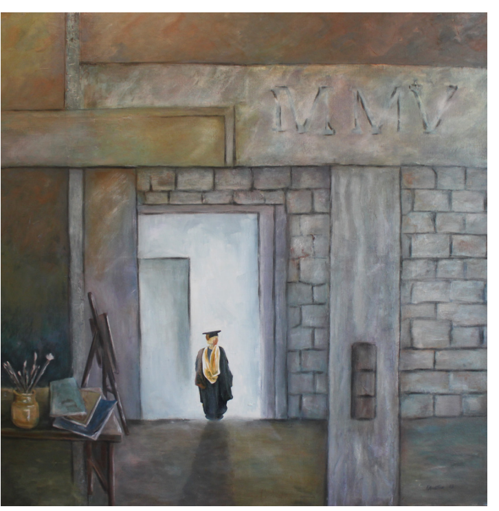
The graduate, 2013, oil on canvas