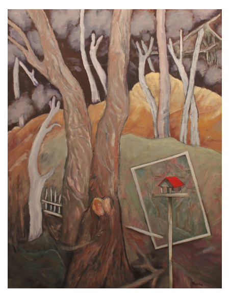
Where are the birds, 2014, oil on canvas