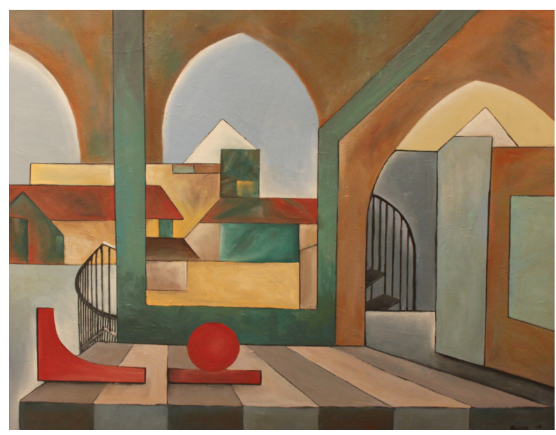
New directions III, 2014, oil on canvas