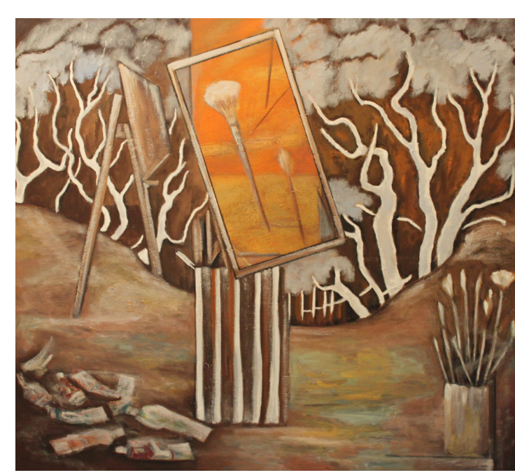
The impossible dream, 2010, oil on canvas