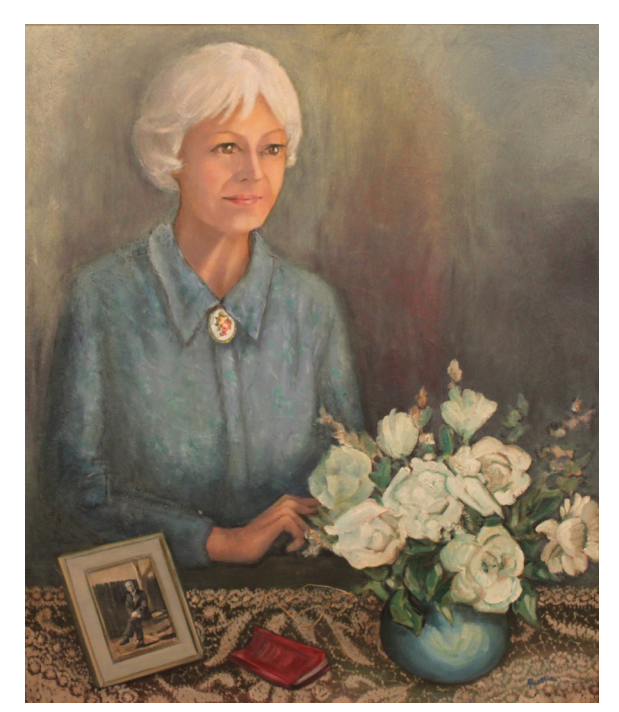
Remembering my father, 1980, oil on canvas