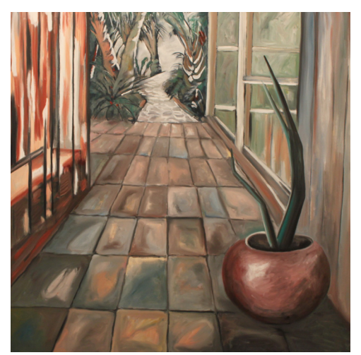
Vanishing point, 2014, oil on canvas