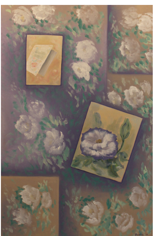
A special occasion, 2014, oil on canvas