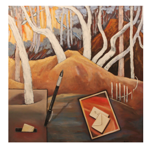
A letter for Shirley, 2013, oil on canvas