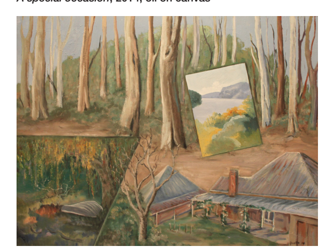
Riversdale, 2014, oil on canvas