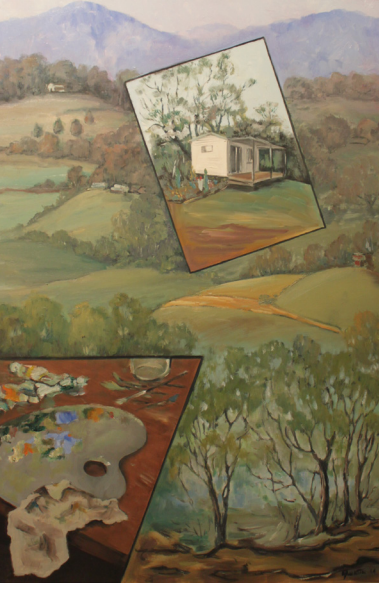
Pinecone studio, 2014, oil on canvas