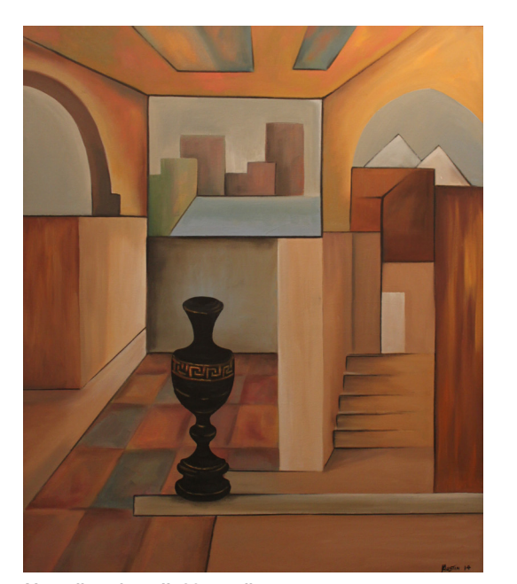
New directions II, 2014, oil on canvas