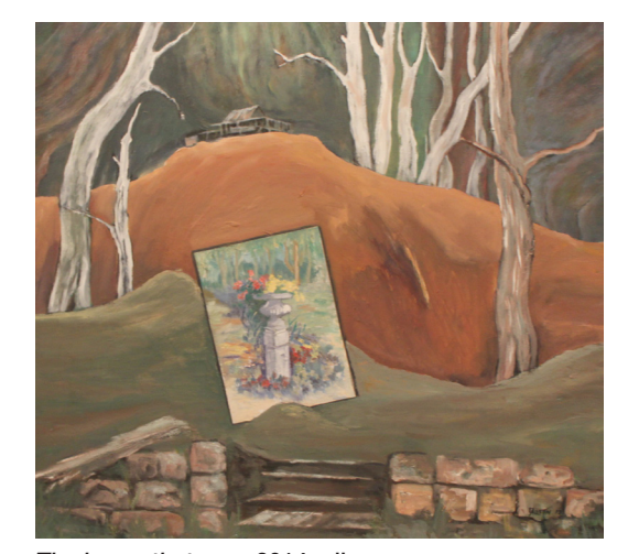
The home that was, 2014, oil on canvas