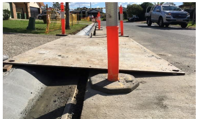
Figure: Typical access provided to driveways where kerb is being replaced.

Council appreciates your patience as we work to improve our road network. For more information about these works, please contact us on (07) 3412 3412 or email rcmcommunications@logan.qld.gov.au