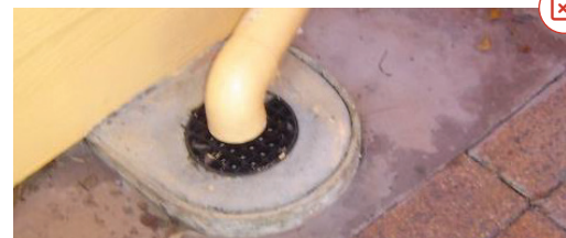
Incorrect installation. A roofwater downpipe draining of an ORG.