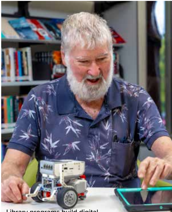
Library programs build digital skills for all ages and abilities.

This includes increasing awareness of the lifelong value of free library membership. There will be a city-wide focus on increasing community engagement and library membership. The library's role in lifelong learning and community wellbeing will inform promotional campaigns. Key messaging will highlight our libraries as welcoming, accessible and modern hubs. Skilled staff will connect people to diverse programs, services and collections. Campaigns will continue to promote our virtual and outreach services. These ensure many library services remain available after the library closes each day.