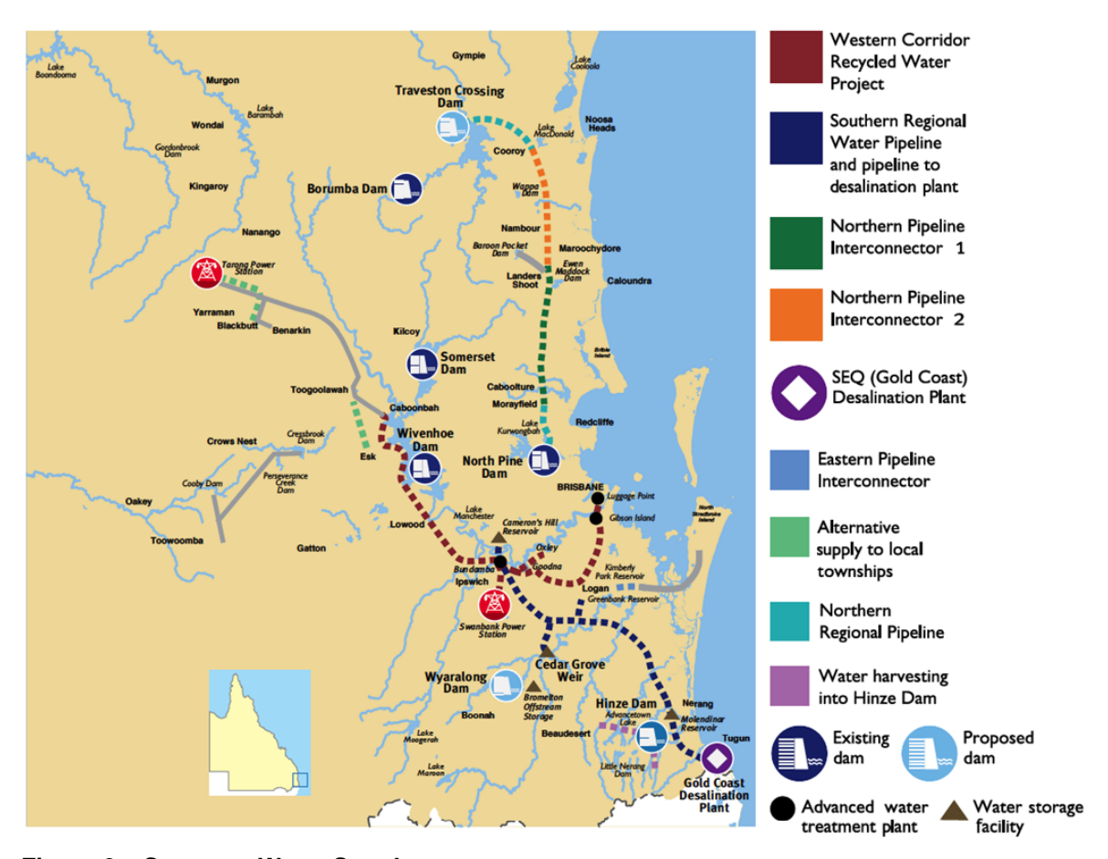
Figure 2 - Seqwater Water Supply

Seqwater is the Queensland Government Statutory Authority responsible for ensuring a safe, secure and reliable water supply for SEQ, as well as managing catchment health and providing recreational facilities to the community.