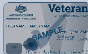
Department of Veterans' Affairs Gold Card