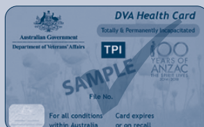
Department of Veterans' Affairs Gold Card TPI