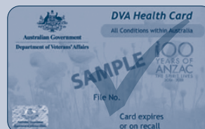
Department of Veterans' Affairs Gold Card